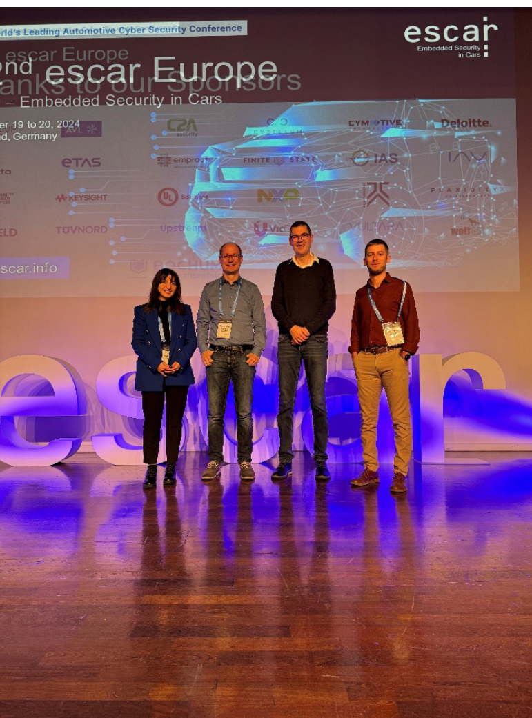
Figure 4: CONNECT representatives at escar Europe

The CONNECT project consortium was proud to contribute to escar Europe 2024, held on November 19th - 20th in Dortmund, Germany. As a leading conference on automotive cybersecurity, the event brought together experts, researchers, and industry leaders to discuss secure mobility systems.