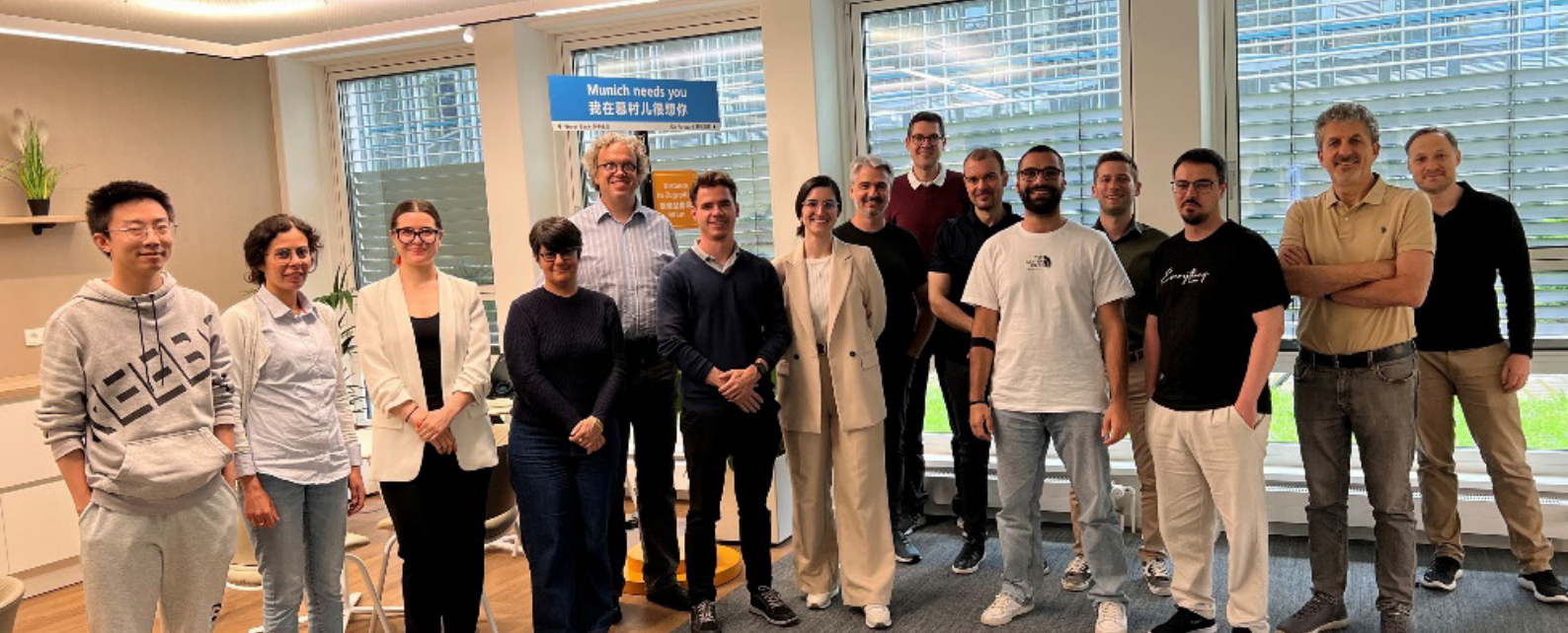
Figure 1: Integration Meeting in Munich (July 2024)