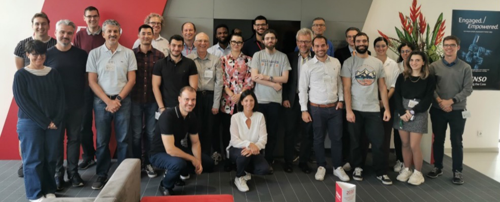
Figure 1: Technical Meeting in Munich (October 2023)