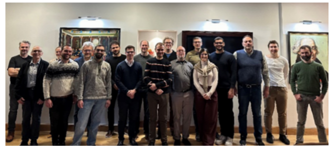
Figure 2: Technical Meeting in Paris (February 2024)

cal components and pathed the way for first implementation activities with regard to our three use cases.